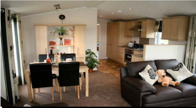
SPRINT FLOOR PLAN 40X14